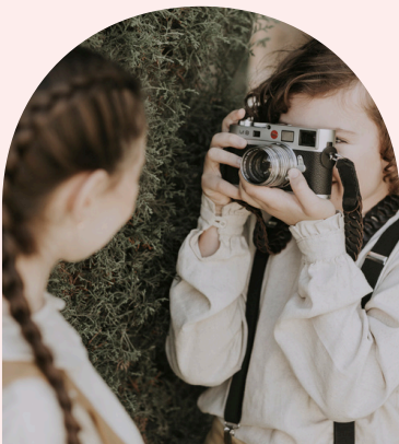
Garden Photo Shoot

Cultivate your relationship and a shared green space with a plant shopping date. Visit a local nursery to select plants or seeds to nurture together at home. This experience symbolizes the growth and care integral to your bond, inviting you to invest in a living reminder of your love.