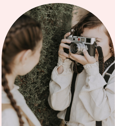
Garden Photo Shoot

Cultivate your relationship and a shared green space with a plant shopping date. Visit a local nursery to select plants or seeds to nurture together at home. This experience symbolizes the growth and care integral to your bond, inviting you to invest in a living reminder of your love.